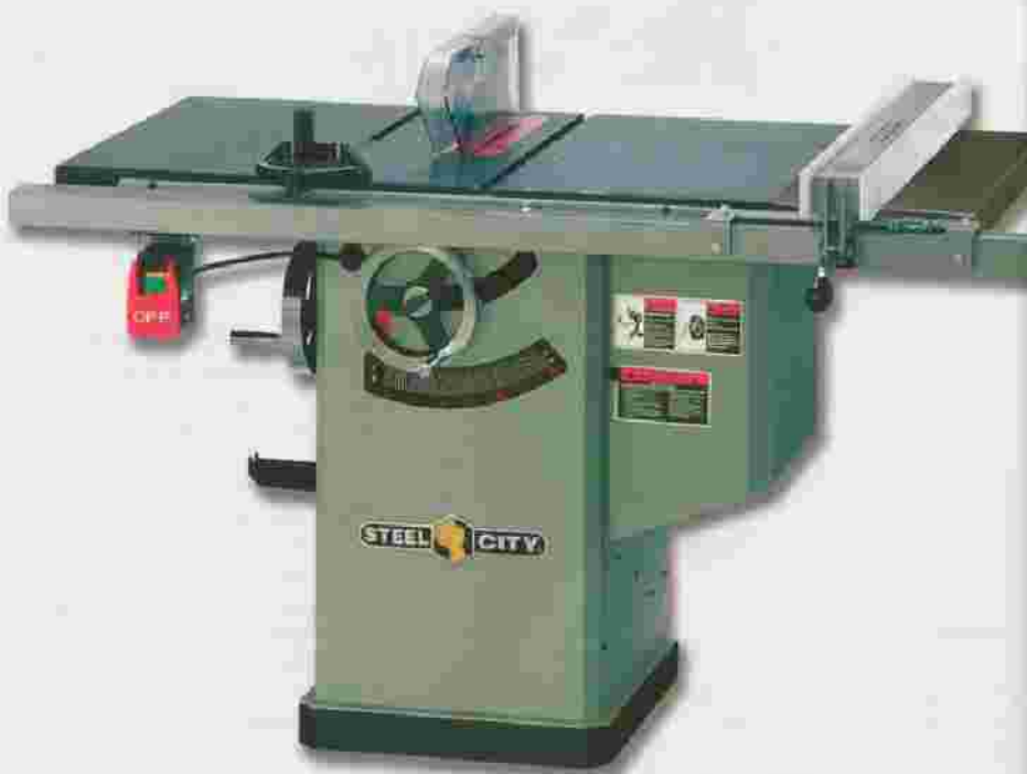
Steel City's granite-top hybrid weighs in at 490 lbs.