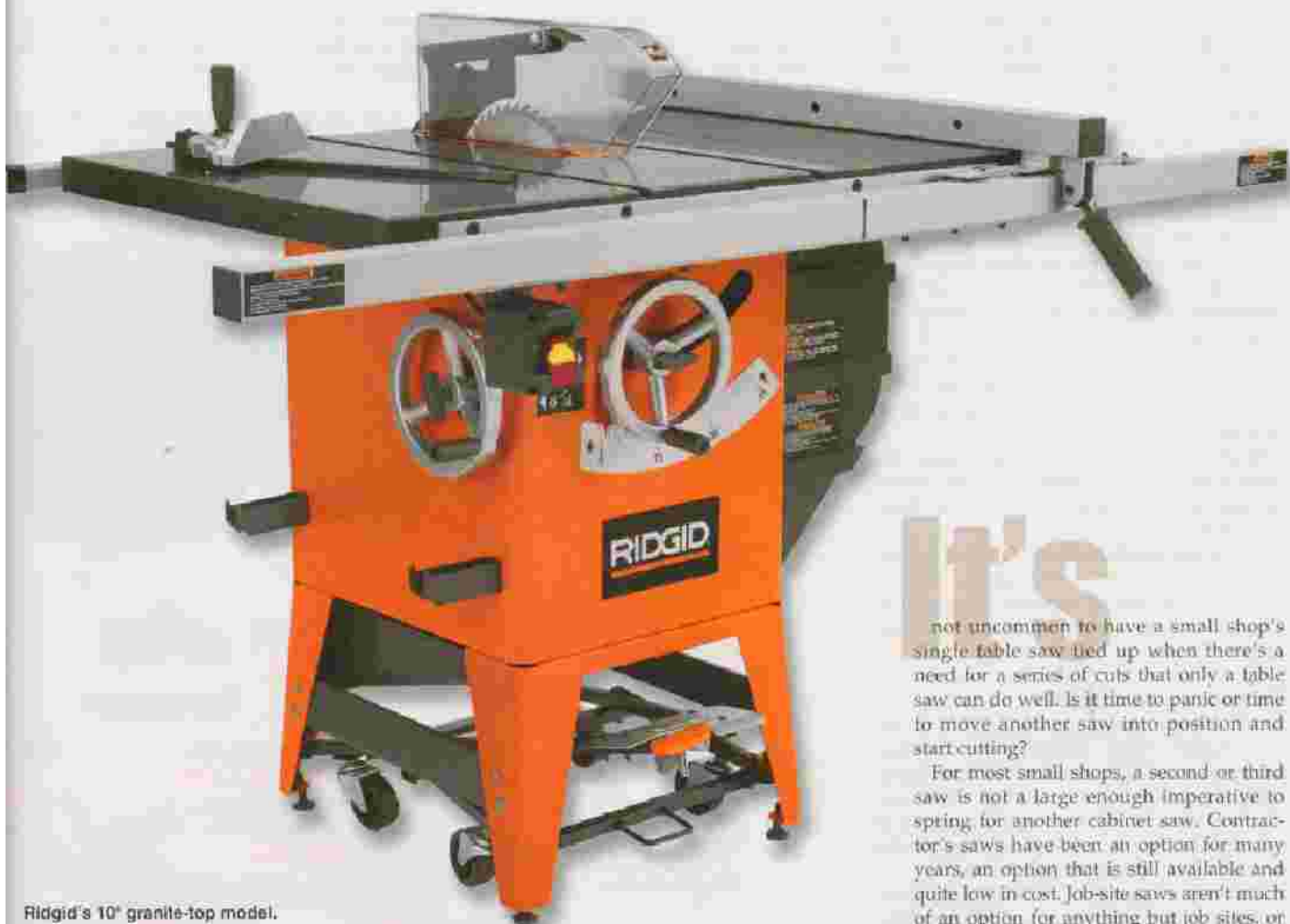
Ridgid's 10" granite-top model.

It's not uncommon to have a small shop's single table saw tied up when there's a need for a series of cuts that only a table saw can do well. Is it time to panic or time to move another saw into position and start cutting?