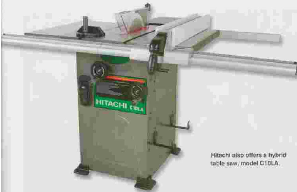
Hitachi also offers a hybrid table saw, model C10LA.

Somewhere in that $600 to $1,300 range, most shops can probably find their standby saw. *