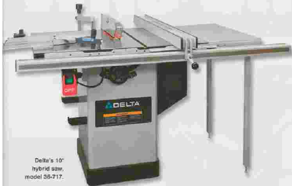
Delta's 10" hybrid saw, model 36-717.

Optional equipment builds tools that do most of the jobs of a full-bore cabinet saw: the DeWalt can be fitted with a sliding table for accurate, wide crosscuts. It comes stan-