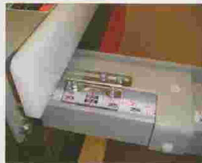
Craftsman's new 22116 hybrid with fence scale (inset).