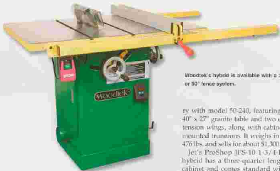
Woodtek's hybrid is available with a 30" or 50" fence system.

ry with model 50-240, featuring a 40" x 27" granite table and two extension wings, along with cabinet-mounted trunnions. It weighs in at 476 lbs. and sells for about $1,300.